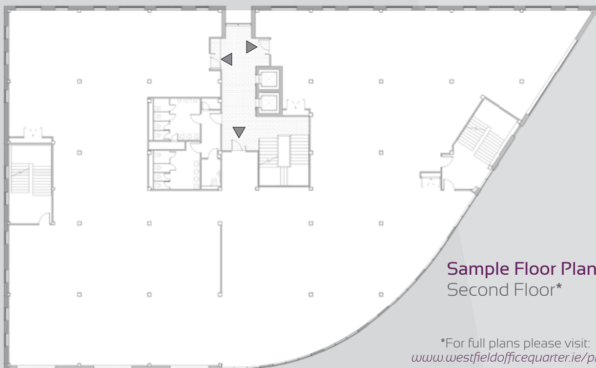
Sample Floor Plan: Second Floor*

*For full plans please visit: www.westfieldofficequarter.ie/plans